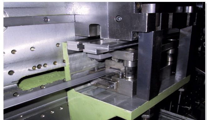
Example of press on PGU machines

The machine is shown without safety barriers for display purposes.